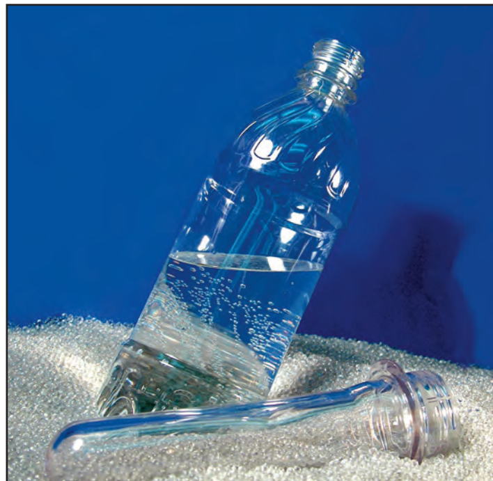
Bottle grade polyester.

Gala's experience in the engineered resins market includes virgin resin production applications as well as special compounding operations. Rate capabilities from 10 kg/h to 15.000 kg/h make the Gala Underwater Pelletizer suitable for lab and pilot scale systems to full scale resin production applications. A particular advantage of using the Gala Underwater Pelletizer for engineered resins is the ability to process a wide range of viscosities, as well as very soft and sticky grades of these polymers.