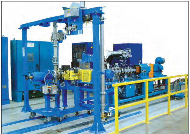
Lab at Gala USA, Eagle Rock, Virginia