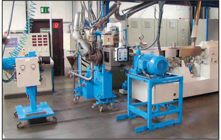
Lab at Gala GmbH, Xanten, Germany

G ala can offer pellet production systems suitable for processing Thermoplastic Polyurethane (TPU); Polyamides (PA); Polyesters (PET, PBT); Styrenics (ABS, SAN); Polycarbonate (PC); Polyoxymethylene (POM/Acetal); Fluoropolymers (PDVF, ECTFE, PTFE, FEP, PFA); Acrylic (PMMA); Polysulfones (PSU, PES); Polyphenylene Sulfide (PPS); Liquid Crystal Polymer (LCP); Polyphenylenoxide (PPO), Polyphenylene Ether (PPE); Phenoxy Resins, and/or combinations of these resins with high performance fiber reinforcements.