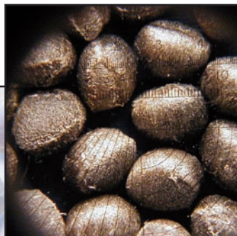
PA-6,6 with 33% glass.