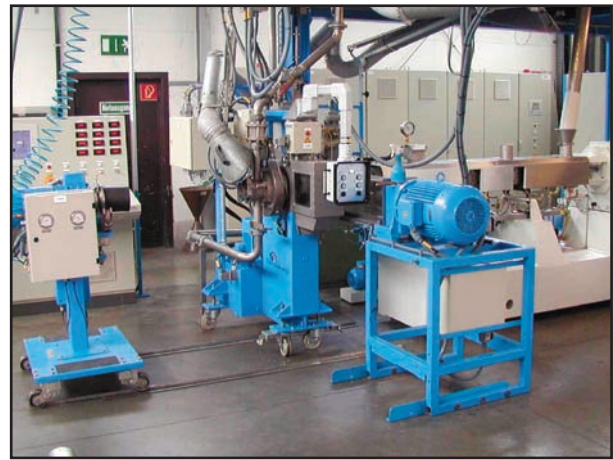
Lab at Gala GmbH, Xanten, Germany

G ala can offer pellet production systems suitable for processing Thermoplastic Polyurethane (TPU); Polyamides (PA); Polyesters (PET, PBT); Styrenics (ABS, SAN); Polycarbonate (PC); Polyoxymethylene (POM/ Acetal); Fluoropolymers (PDVF, ECTFE, PTFE, FEP, PFA); Acrylic (PMMA); Polysulfones (PSU, PES); Polyphenylene Sulfide (PPS); Liquid Crystal Polymer (LCP); Polyphenylenoxide (PPO), Polyphenylene Ether (PPE); Phenoxy Resins, and/or combinations of these resins with high performance fiber reinforcements.