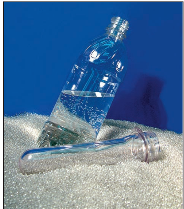
Bottle grade polyester.

Gala's experience in the engineered resins market includes virgin resin production applications as well as special compounding operations. Rate capabilities from 10 kg/h to 10,000 kg/h make the Gala Underwater Pelletizer suitable for lab and pilot scale systems to full scale resin production applications. A particular advantage of using the Gala Underwater Pelletizer for engineered resins is the ability to process a wide range of viscosities, as well as very soft and sticky grades of these polymers.