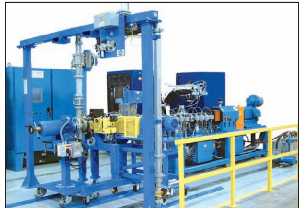
Lab at Gala USA, Eagle Rock, Virginia