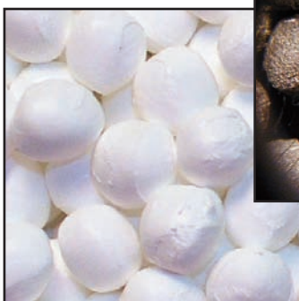
PA-6 with 5% TiO 2