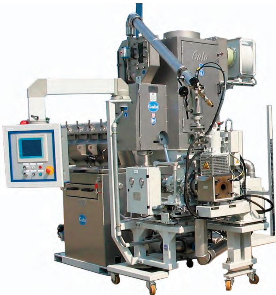
Gala CPT Process System

A recent theoretical analysis, done by Bepex Corporation, looked at a 600 t/day PET plant (2 lines each processing equals 12.5 t/h). The analysis compared a plant using strand pelletization, conventional crystallization and SSP to a plant using Gala underwater pelletization and CPT process going directly into the Solid State Polymerization (SSP) Process. The study showed that by using the Gala underwater pelletization and CPT process, the plant could realize approximately a 50% reduction in capital cost and a 30% reduction in energy consumption.